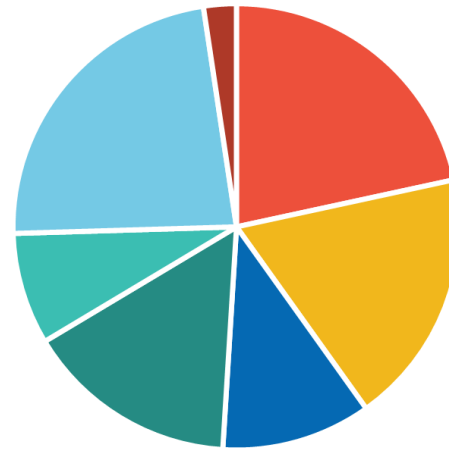
Revenue By Program