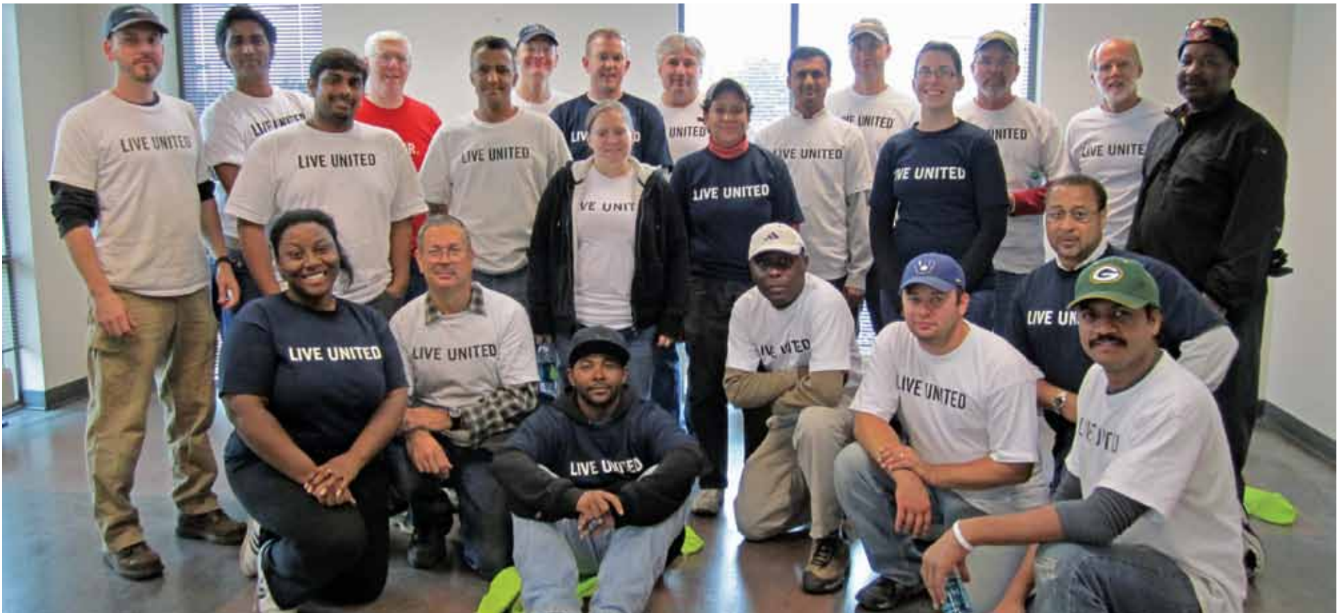
Riverworks staff and the Rockwell Automation Volunteers