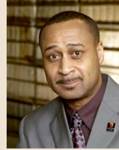
Message from the Executive Director