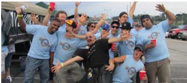
Attendees of 2011 Riverworks Tailgate

On Friday, August 12th the Riverworks Business Improvement Districts hosted their first annual Brewers Tailgate event and we're glad to report that it was a great success! 151 attended the event which included great catered food from Bunzel's Old Fashioned Meat Market, beer from Lakefront Brewery, a cool Riverworks Tailgate T-Shirt, and a free Brewers Hat from Cap Night. More than anything we hope those in attendance enjoyed the camaraderie from everyone in attendance, which not only included employees from BID businesses but their families and friends as well. To cap it all off, the Brewers beat the Pirates 7-2 behind impressive back-to-back home runs by Braun and Fielder.