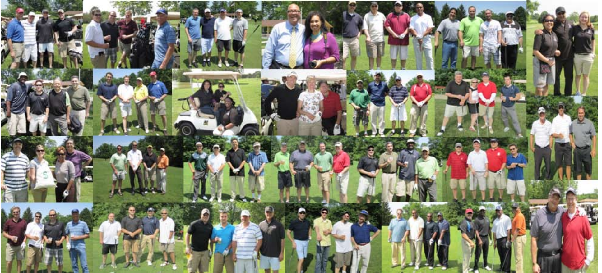
Teams from the 2011 Riverworks Golf Outing